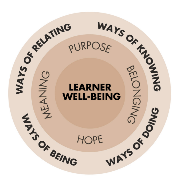
Diagram 3: Learner Well-Being - Indigenous Ways of Knowing, Doing, Being, and Relating

As a holistic framework, each element is equal and supports the others. If one element is out of balance, it affects the whole.