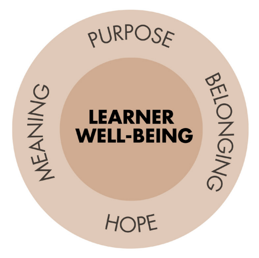
Diagram 2: Learner Well-Being - A Holistic Approach

Each aspect is equal in importance and works with the other aspects to contribute to well-being.