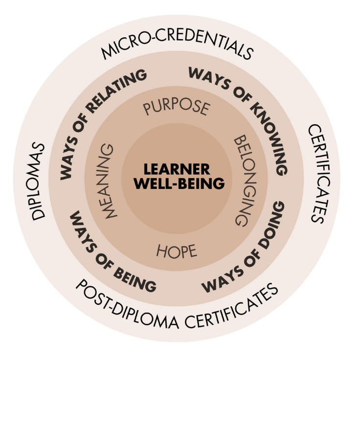
Diagram 4: A Holistic Approach to Standards and Benchmarks for Credentials.

The standards and benchmarks build on and incorporate learner well-being and embrace Indigenous ways of knowing, doing, being, and relating.